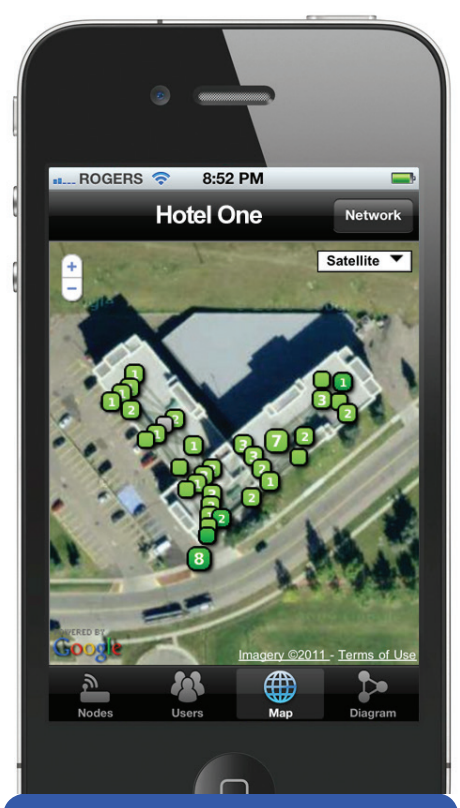
Monitor your network... from anywhere.

the signal between the routers and minimizes potential "hops" and low signal quality that will slow down the network. Add additional nodes as needed (typically in larger units) to boost signals in specific areas.